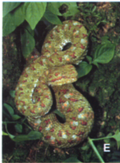
Fig. 1. Variation of color patterns. A-D B. supraciliaris , E B. schlegelii , all Costa Rica