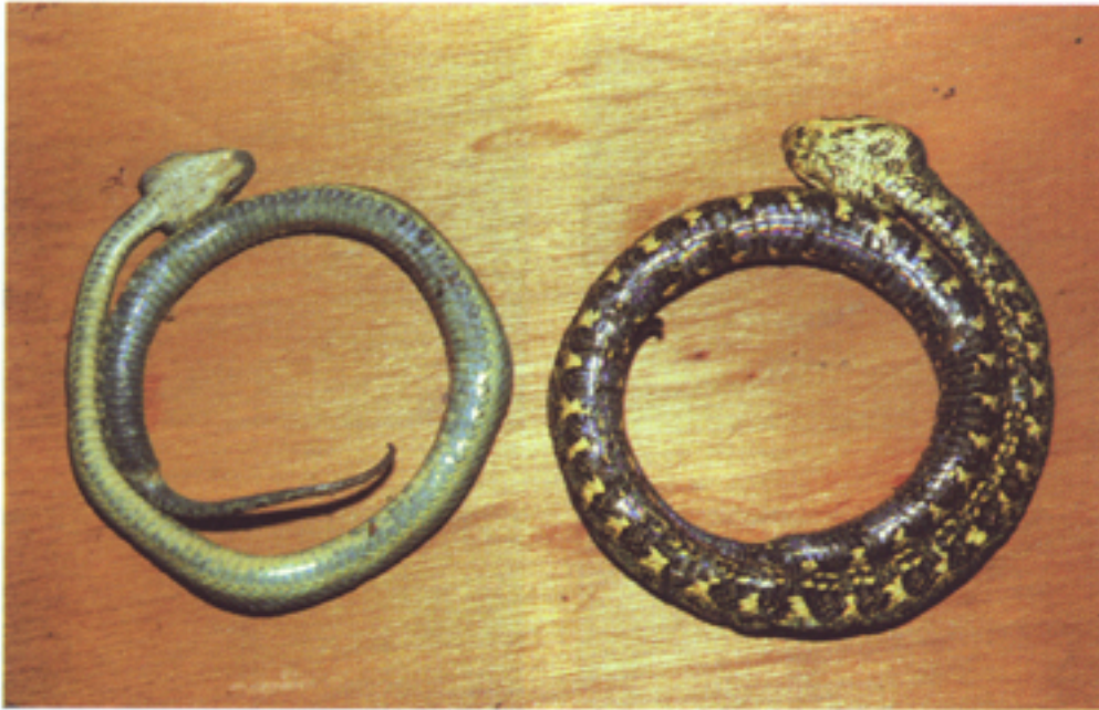
Fig. 2. Ventral view of B. supraciliaris (left) and of B. schlegelii

Based on these results, we conclude that Bothriechis supraciliaris warrants specific recognition and it is here redescribed: